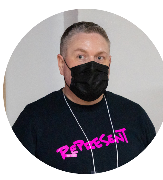
From the Executive Director

These last six months I have been SPECTRUM's only full-time employee. Without the incredible support of our dedicated volunteers we would not be able to do nearly as much as we do. Thank you to you all! I'm especially grateful to our Board of Directors who are governing the organization through a time of exceptional transition. I'm grateful for the faith you've shown in me to execute on our Strategic Plan and I look forward to what comes next.